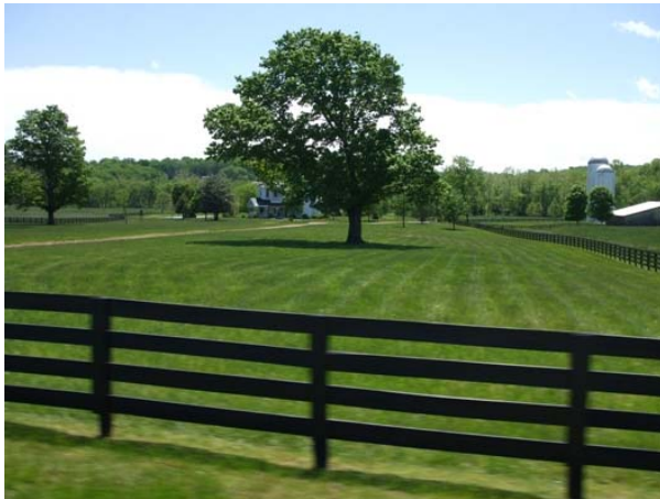
Nicely kept farm – part of the morning drive.