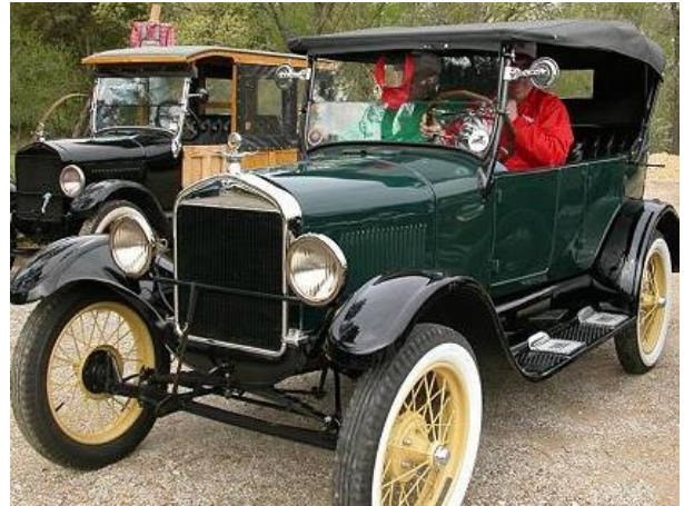
More Sharp Cars!