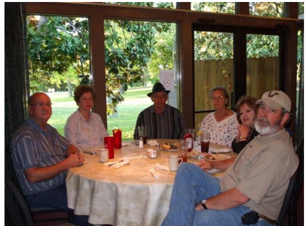
Some of the gang at Henry Horton.