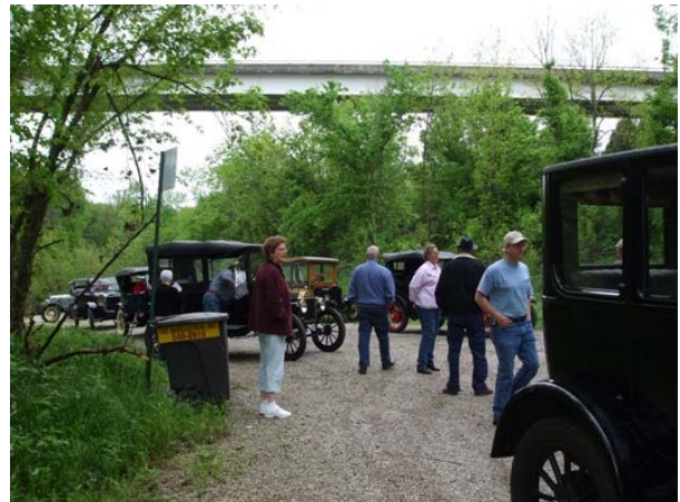
Rest stop and photo op near the river.