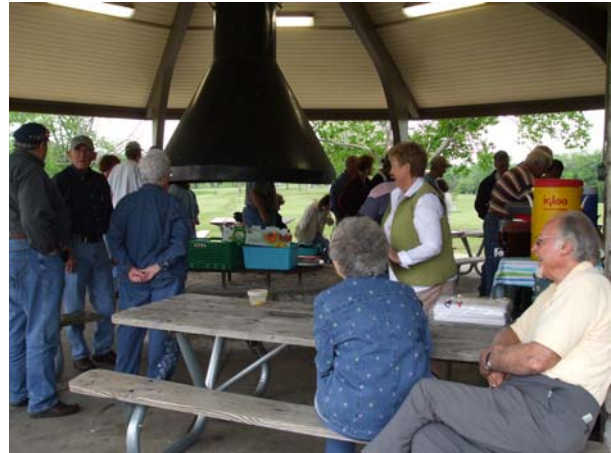
Friday night feed and story telling time. A lot of new folks showed up for this tour.