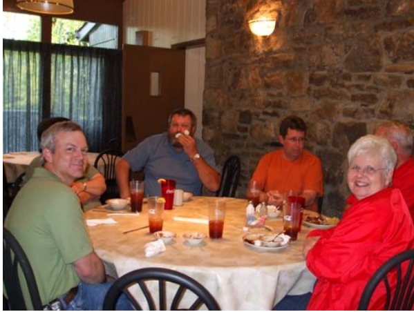
Here we are – eating again!