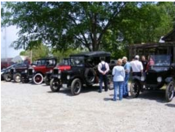
T's at Vinegar Jim's

This bunch never gets too far from food!