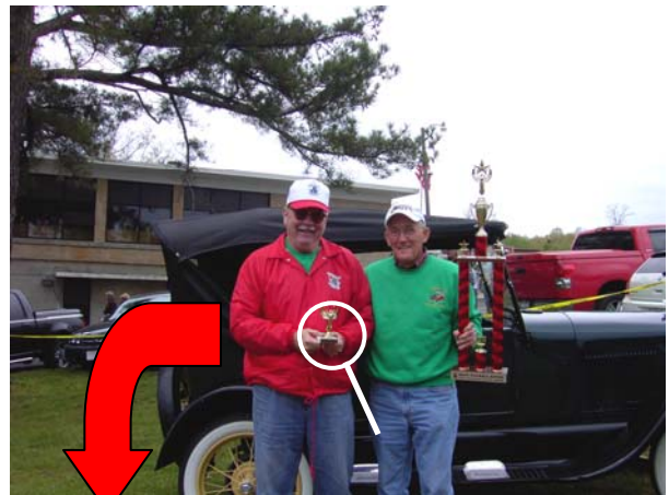
Other Trophy Winners!