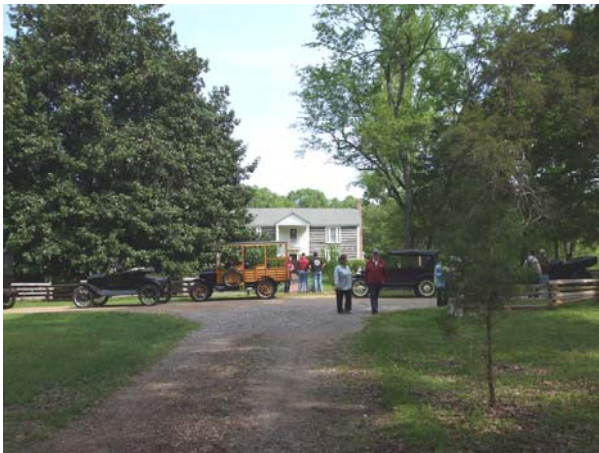
Another picture in front of Davies Manor