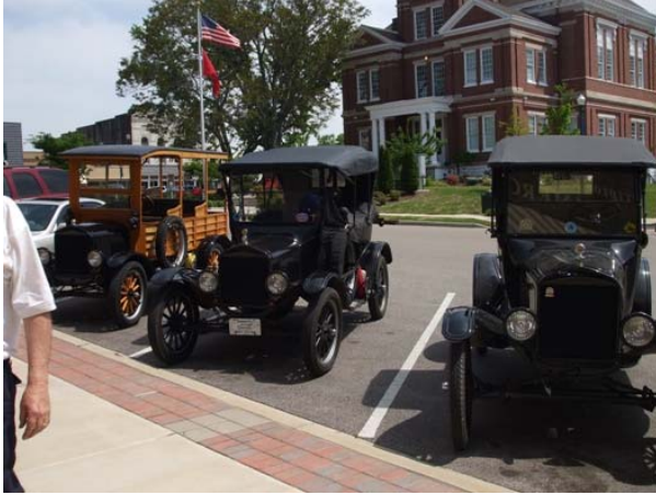
T's on the square in Covington.