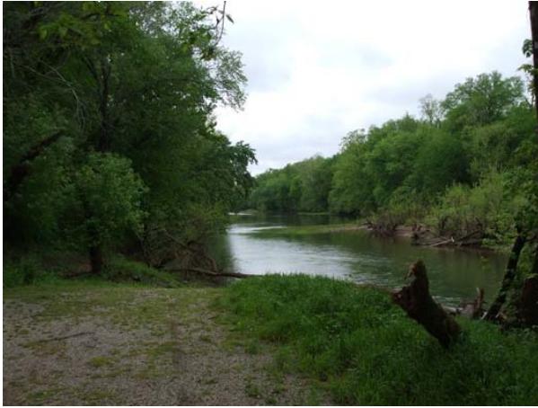
OK, where are the cane poles and worms?