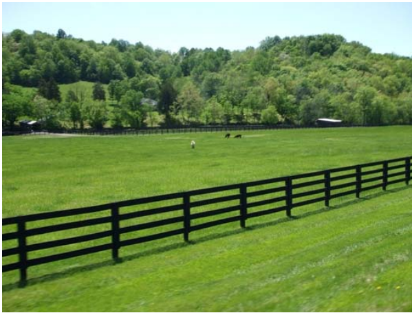
A nice pasture complete with the beast that the T finally replaced.