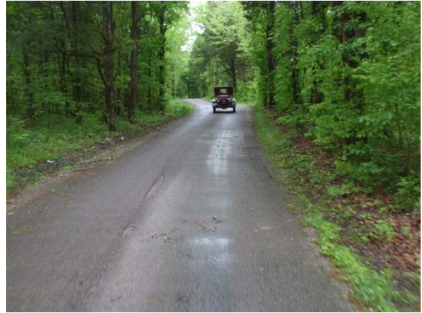
Follow that T! Charlie and Jerry picked some great roads for a drive. The rain was cleared out by 6:00 AM and by 10:00 the sun was shining.