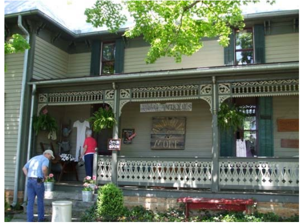
One of the many antique shops in Leiperts Fork