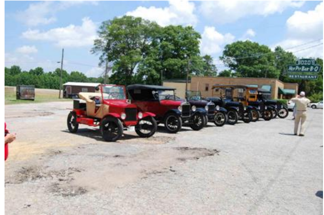
Tour exploration committee 6/12/2010. Bozo's BBQ near Memphis. Six cars, it was only about 96 out, Very Hot!