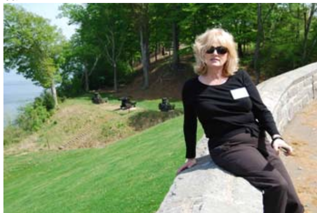
Loose cannon (and a few Civil War artillery pieces at Fort Donnellson, TN).