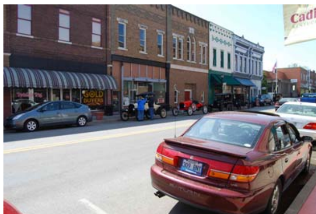
Cadiz is a neat old town with a lot of antique shops.