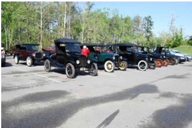
Saturday morning lined up in front of the hotel, ready for the day's driving.

The following photos and captions were sent to me by Darrel Carter. These are of the LBL Tour.