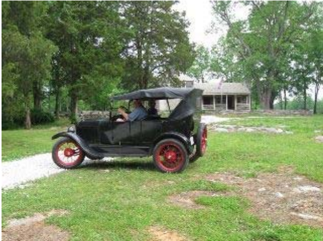
Charlie and Janna turning the group around in front of the boyhood home of Nathan Bedford Forrest

The day started out very well. We all met in Chapel Hill at a little mom and pop place for breakfast. The special (eggs, bacon, biscuits and gravy, grits, hash browns and coffee) was under $4. With our tanks full we decided to play follow the leader.