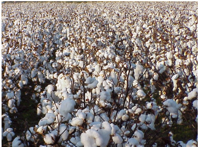
Ya'll get ready to come to West TN and see our official regional flower (Cotton).