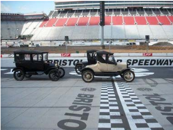
Ready for a few hot laps at Bristol Motor Speedway.