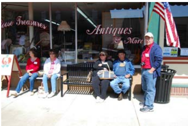
Rough crowd in front of one of the antique stores in Cadiz.