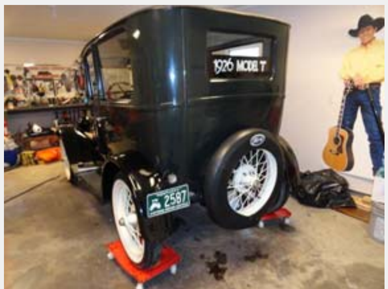
The Lowery's beautiful restoration. Great job!