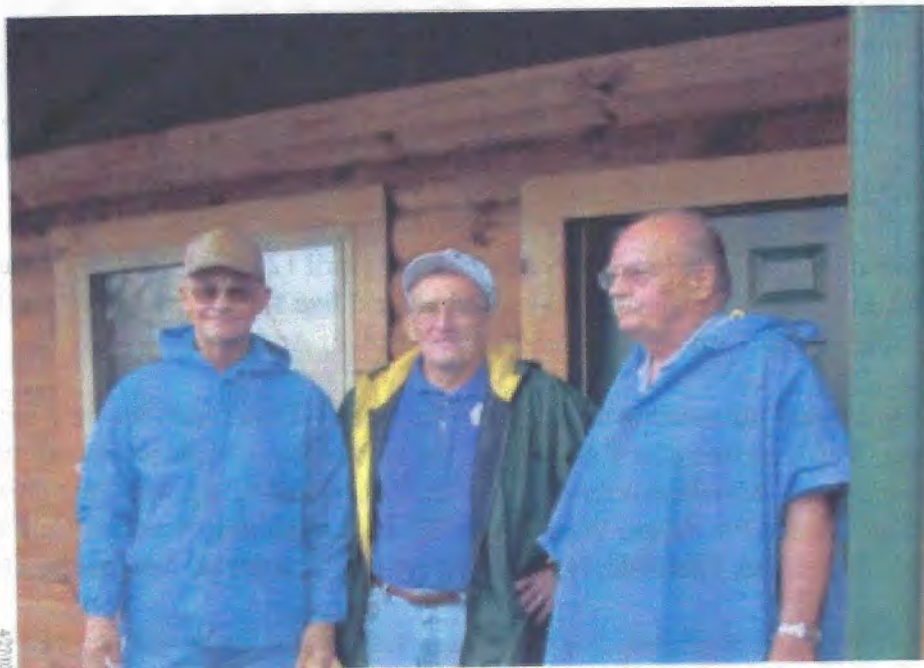
Sunday morning, April 14, 2002. LBL Tour III. Rain gear!!! On a T trip?