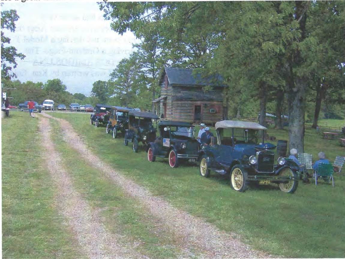
KICKED BACK IN THE SHADE AT HISTORIC COLLINSVILLE