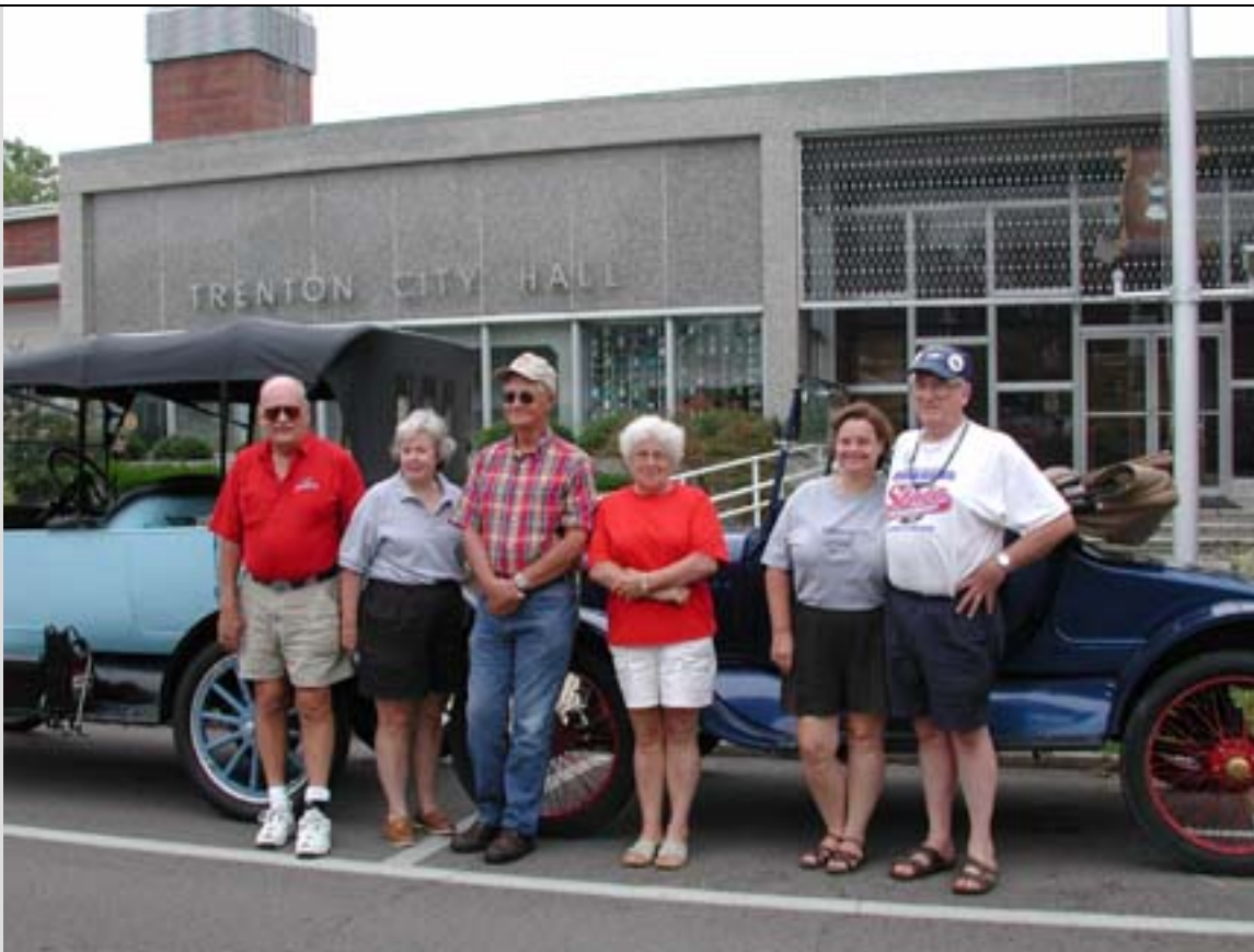
Vintage photo: Trenton TN at the "T"eapot museum. A small weekend tour, summer of 2002.