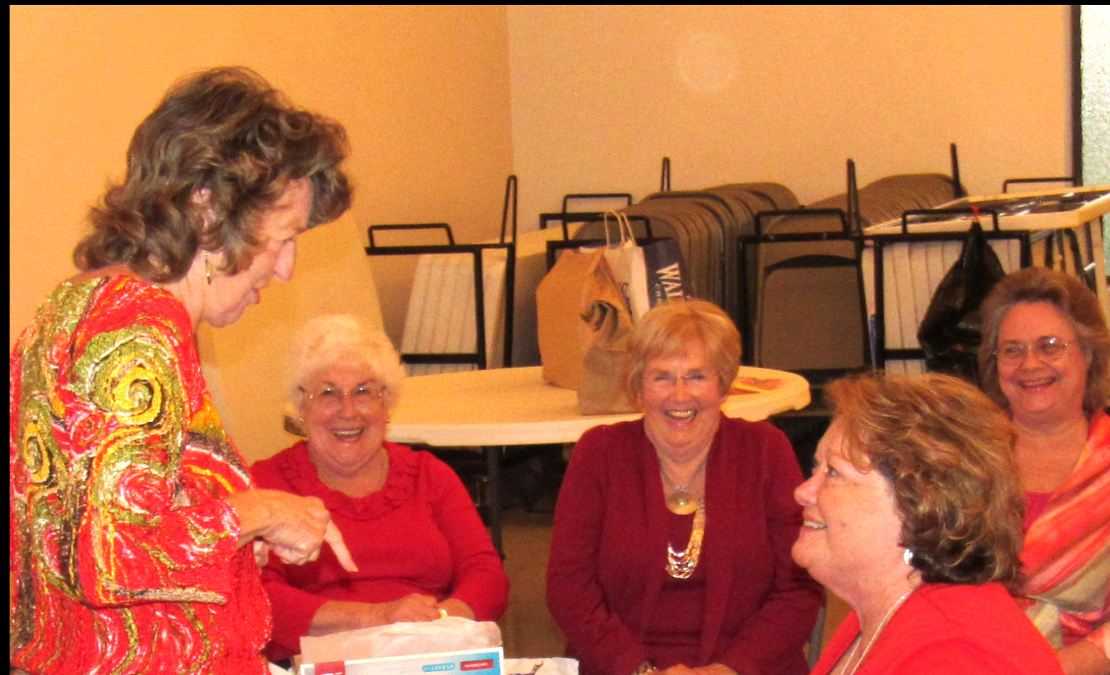
Kind words were not always spoken!