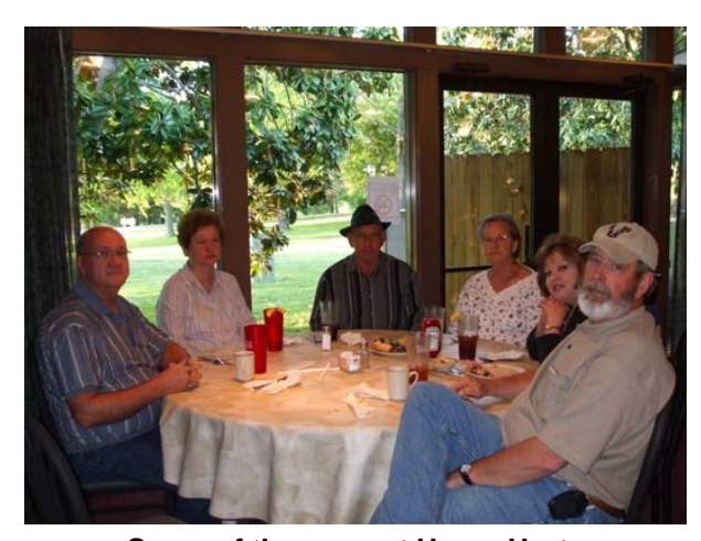
Some of the gang at Henry Horton.