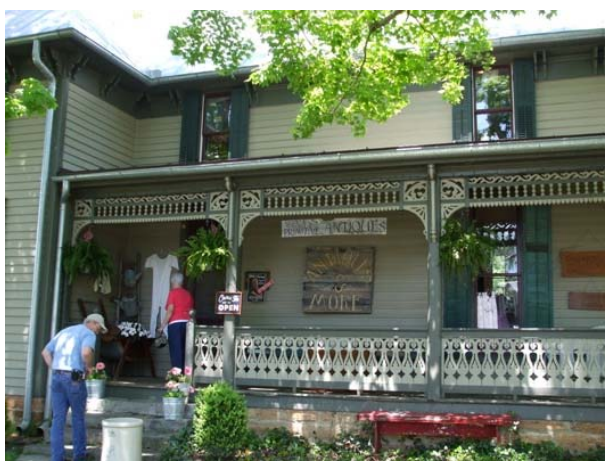
One of the many antique shops in Leiperts Fork