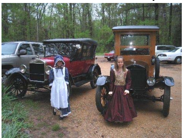
The next stop was an antebellum plantation, Waverly Mansion, where we were greeted by a couple of appropriately dressed hosts.