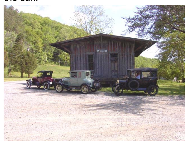
Is the train gonna be on time today?

After spending the night in Kimball, TN we traveled up Sequatchie Valley on the old highway to Pikeville, TN and enjoyed lunch at the Main Street Café.