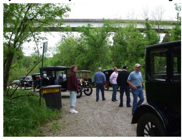
Rest stop and photo op near the river.