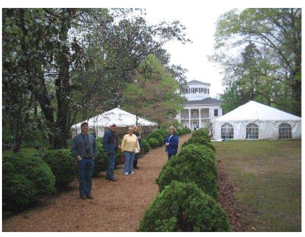
Waverly mansion, built in 1854 was once part of a 14,000 acre farm between Columbus and West Point. The house has been restored and is open for tours.