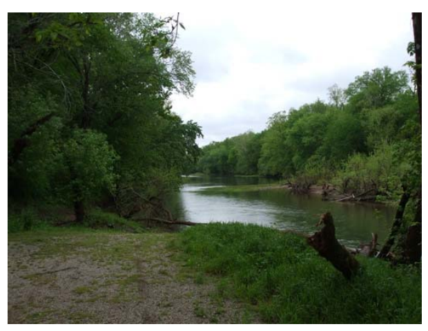
OK, where are the cane poles and worms?