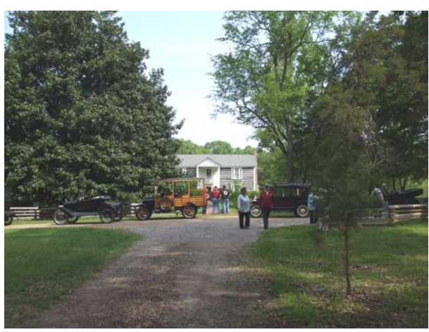
Another picture in front of Davies Manor