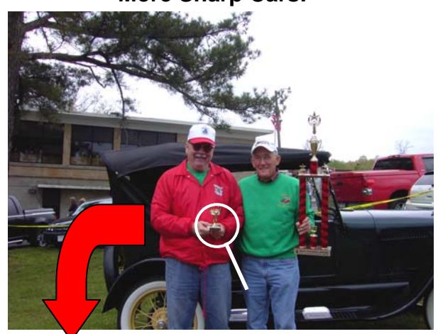
Other Trophy Winners!