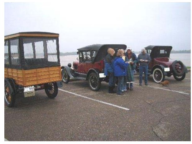
The morning started out with a quick visit to the Columbus lock & dam on the Tombigbee Waterway. As you can see from the coats and side curtains that it was a little chilly.