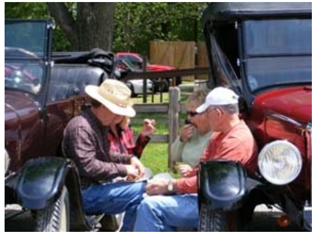
Ah yes, nothing like the good old funnel cakes sold at the local festivals in anytown USA. What better place to eat them than the running board?