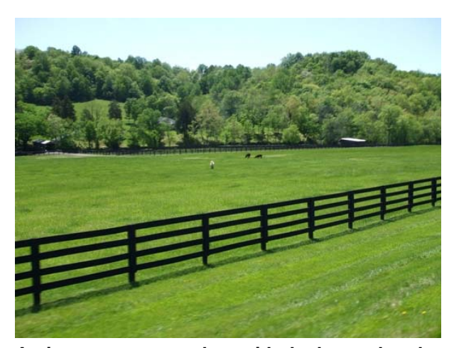
A nice pasture complete with the beast that the T finally replaced.