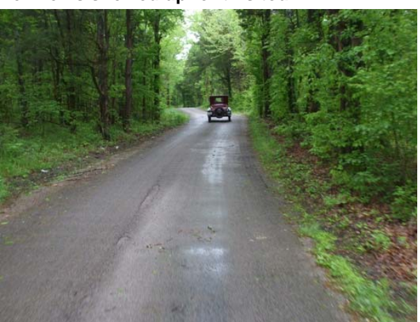
Follow that T! Charlie and Jerry picked some great roads for a drive. The rain was cleared out by 6:00 AM and by 10:00 the sun was shining.