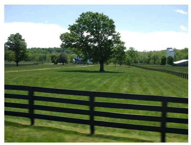
Nicely kept farm - part of the morning drive.