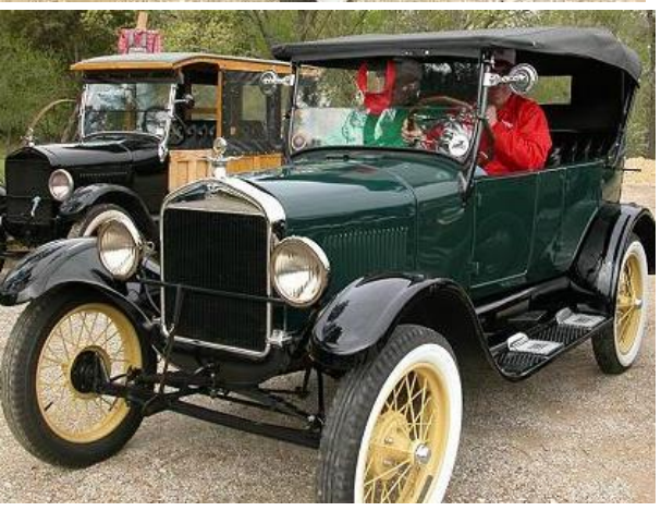
More Sharp Cars!