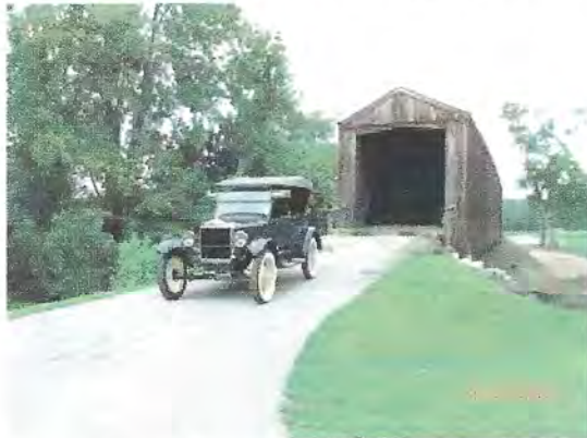
Gary Curtis pretending to drive across!

September 2-7, 2008 twenty one members of the TN T's attended the 25 th anniversary of the Hillbilly Tour in Cape Girardeau, MO