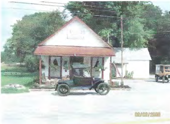
How perfect is that? Looks like a calendar picture to me.