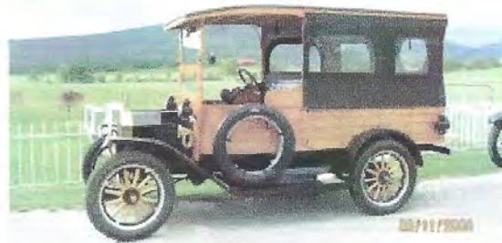
Beautiful grassy cove near Spring City, Tennessee.