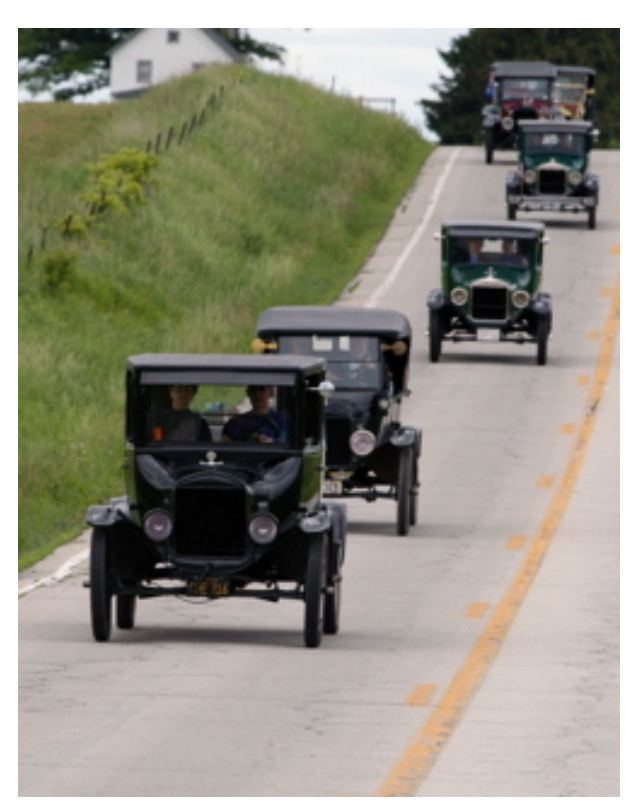
T's on tour.