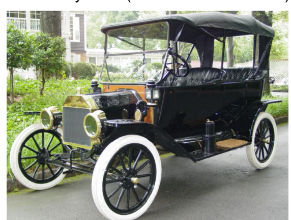
One of Six Fords - now 8 years old!

Rumor has it, after they completed the publicity tour in preparation for the 2003 100 year celebration event that they were given to the Henry Ford museum. Today these cars are in daily service (8-hours a day) at Greenfield Village giving rides around the village for those who wish to ride in a model T. I have been told they have been modified slightly with the addition of electric start and electronic ignition. I'm guessing that means these modifications are officially now sanctioned by Ford (sure to start a debate).