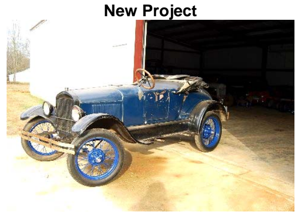
Darrel Carter picked up this nice 26 Roadster. Check out that bumper!

Make sure your car is safe for the season; please review the clubs safety guidelines.