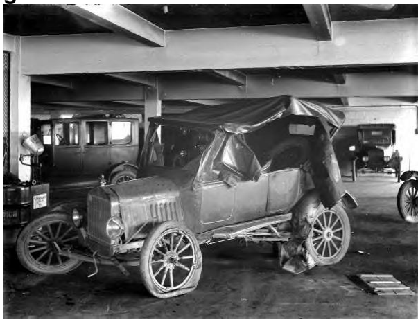
This one needs a bit of help!

Make sure your car is safe for the season; please review the clubs safety guidelines.