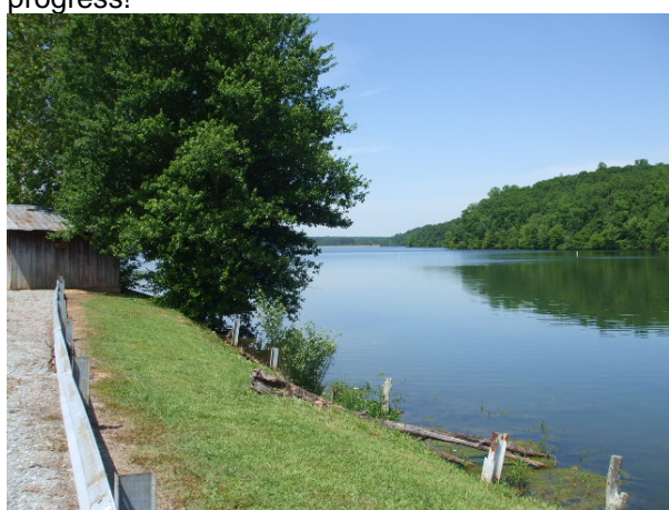
Peaceful lake near Lawrenceburg