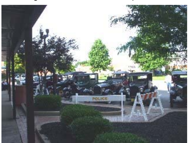
Special parking treatment