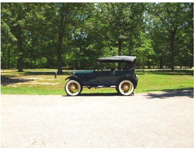
Gary Curtis' car along the Trace