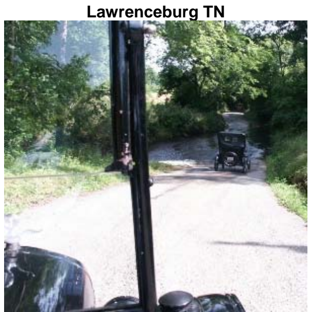
Driving across small stream. We all made it!