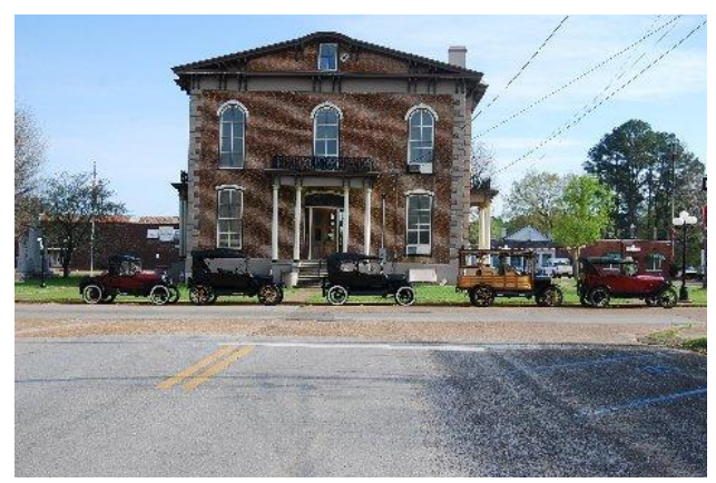
Carrolton courthouse where, supposedly, a face appears in one of the garret windows.