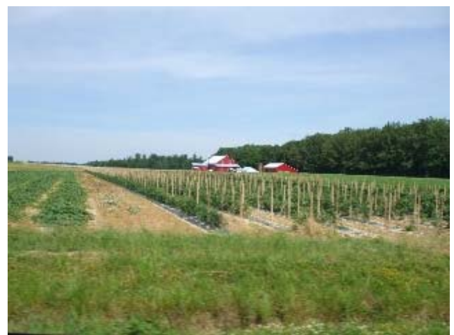
Amish farmland near Etheridge TN