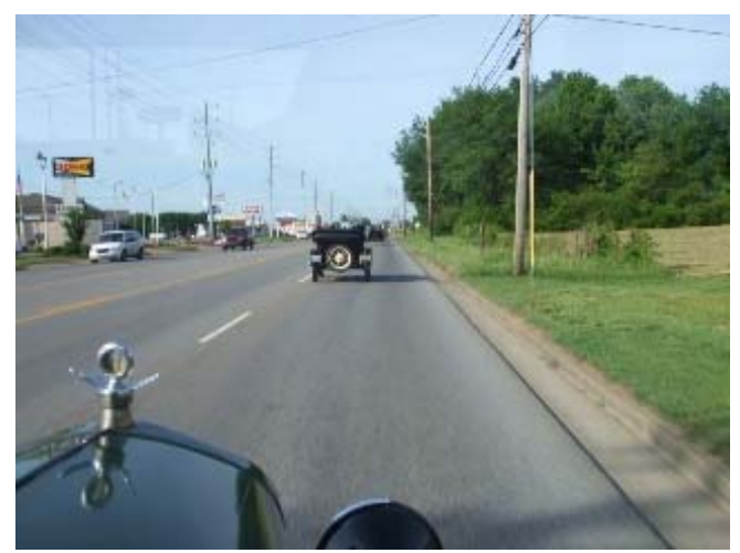
T's on the move in Lawrenceburg