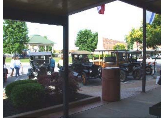
Taking a break on the town square.