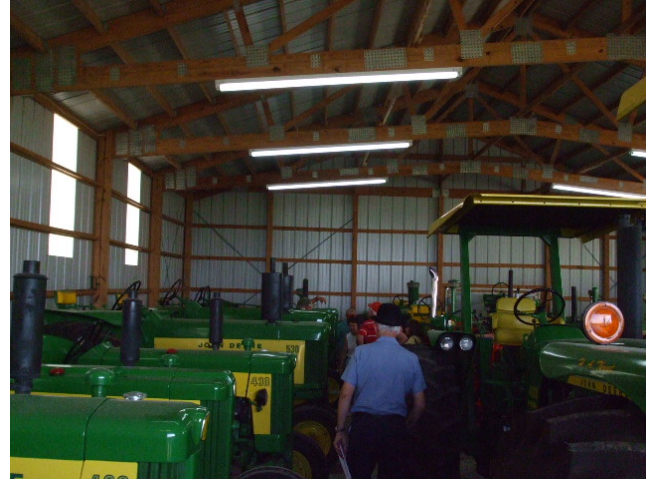
H.A. Threet has a large collection of restored tractor.