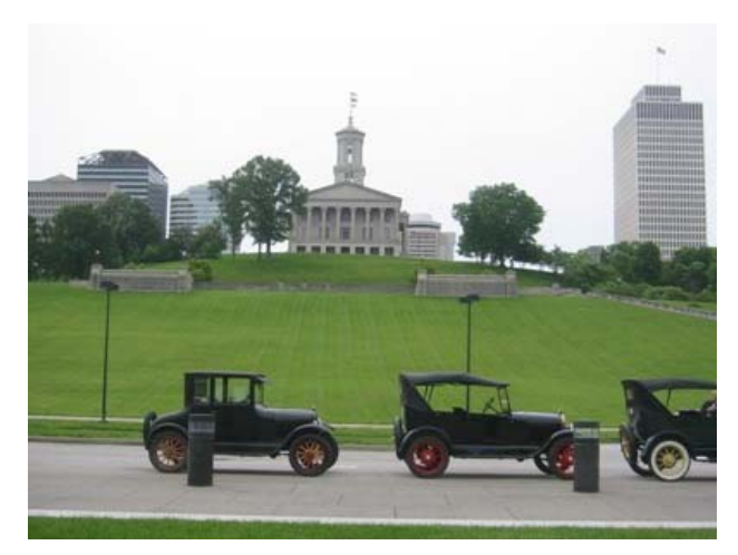
Taking care of business at the capitol building