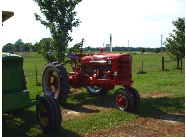
He even has some Red ones and Orange and Blue