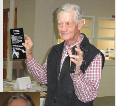
And the winner is --->