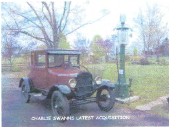
CHARLIE SWANN'S LATEST ACQUISITION