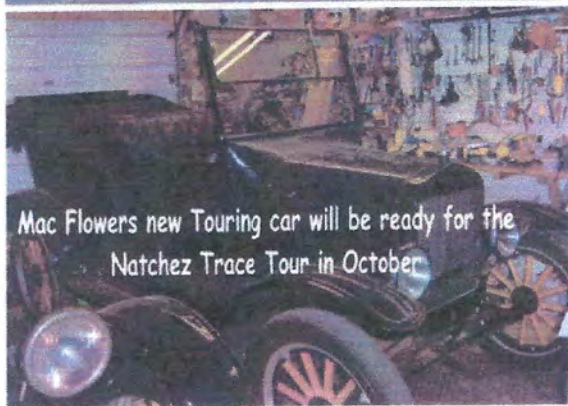
Mac Flowers new Touring car will be ready for the Natchez Trace Tour in October