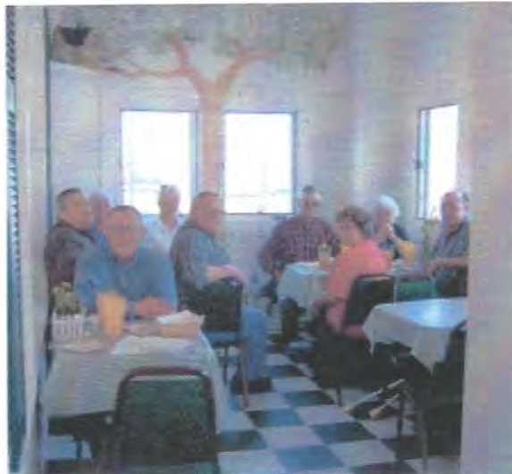
Lunch at The Front Porch in Dickson last day. Should the infamous "Catfish" investigate the scene below??????

The final day, we left the motel early and arrived at the Carnton Plantation. The tour was set to begin early, but the staff claimed they were not notified and we did not want to wait, so we took some pictures and wandered the yard of the plantation. We drove through downtown Franklin and on to Leipers Fork stopping for shopping and touring. We traveled the scenic roads to our lunch spot the Front Porch Restaurant. Any good tour ends with ice cream, as did this one. We all went back to Larry and Carolyn's and picked up our trailers and then on to the motel in Waverly. Larry picked up all of us in several trips and we had a final dinner in Waverly on the main street (and of course ice cream after). We said our farewells, thanked our hosts and left hoping to see each of them on another tour.