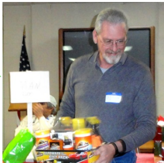
Clean hands forever.