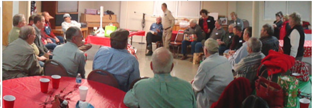
What can I steal?