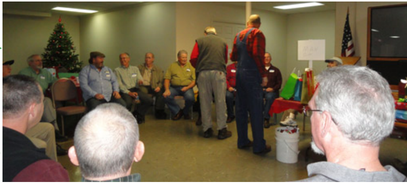
Men's dirty Santa.