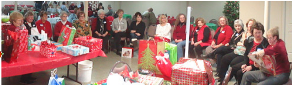
Ladies dirty Santa.....I heard "What size is it? Extra large?"