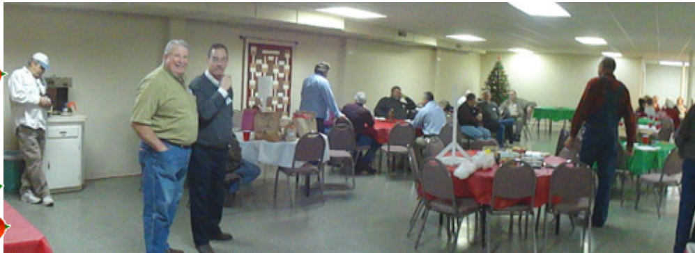
Early arrivals waiting for Santa.

Santa sez "Stealing is OK one night a year! Steal away!" "Ho-ho-ho!"